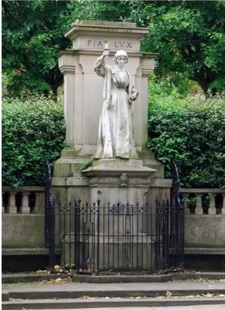
Nightingale Statue, London Road, Derby